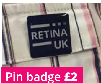
Pin badge £2