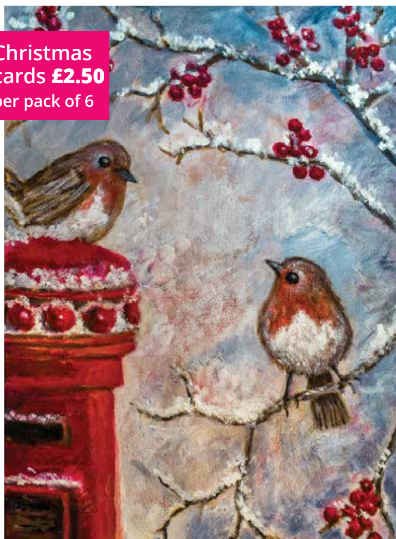
Christmas cards £2.50 per pack of 6