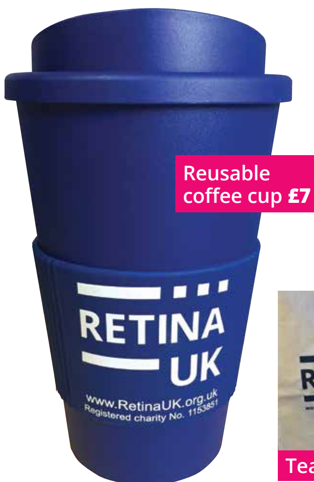
Reusable coffee cup £7

Visit the Retina UK online shop at www.RetinaUK.org.uk/shop today to buy Retina UK merchandise such as t-shirts, coffee cups, tea towels and pin badges! Great for stocking fillers, this is an easy way to let everyone know that you support our charity!