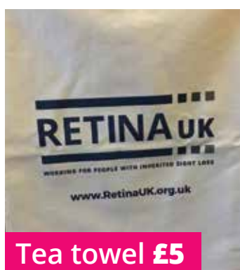
Tea towel £5