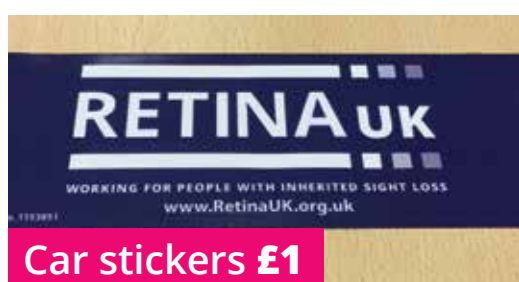
Car stickers £1